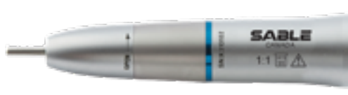
1610310 1:1 Ball-Bearing Nosecone (w/ Air & Water) Q1 Promo: 4+1*