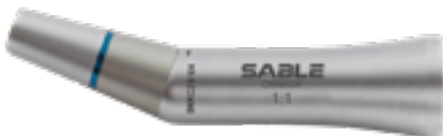
1610210 1:1 Contra Angle with Air & Water Q1 Promo: 4+1*